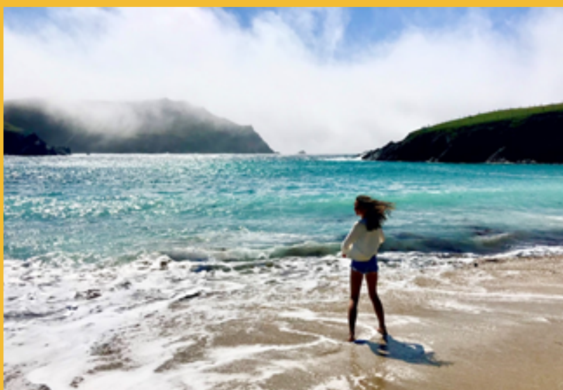
€50 Louise Casey – Education